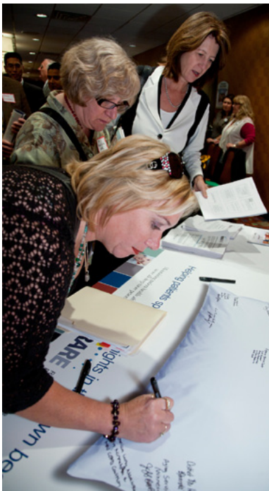
Attendees at the RARE celebratory event sign a poster to show their organizations' commitment to the campaign goals.

PARTNERSHIP FOR PATIENTS, MILLION HEARTS, RARE, HOME HEALTH QUALITY IMPROVEMENT NATIONAL CAMPAIGN—the campaigns, initiatives, and other efforts aimed at improving health care quality and value abound. With the changes flowing from health reform, ever more improvement offerings are being made available. That leaves health care organizations to sort through numerous invitations to participate and to be cautious of engendering quality improvement burnout among staff.